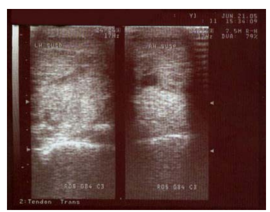
Figure 4: Suspensory Lesion, June 21, 2005

Physical examination on June 21, 2005 revealed the horse to be 2/5 lame at the trot with mild residual swelling around the suspensory region of the mid-distal metatarsus. Although a noticeable lesion still remained, ultrasound evaluation revealed an improved fiber patterning of the left hind suspensory ligament. (Fig 4).