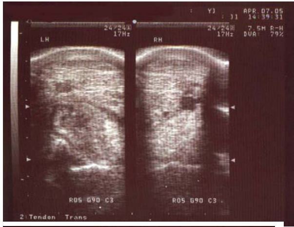
Figure 1: Diffuse Suspensory Lesion, Right Hind Limb April 7, 2005

On April 7, 2005 a 6 year-old American Quarter Horse gelding presented for lameness examination. According to the owner's report, the horse was shown at a cutting event the previous evening and became very sore in the left hind limb. Previous radiographs of the left hind limb revealed no bony changes to the tarsal or metatarsal structures. Ultrasound evaluation of the left hind flexor tendons on April 11 revealed the following findings: enlargement of the body of the suspensory ligament in the mid-cannon region that measured twice as thick as the dorso-plantar aspect when compared to the contalateral limb, a mixed echogenic pattern characterized by multiple, ill-defined hypoechoic regions, and a disrupted fiber pattern in both longitudinal and transverse views (Fig 1, 2, 3).