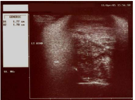
Figure 2: Suspensory Lesion April 11, 2005