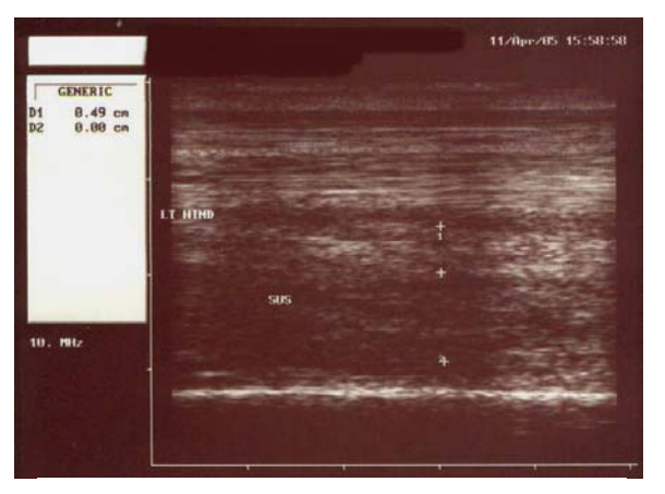
Figure 3: Suspensory Lesion, Longitudinal View April 11, 2005

Based on ultrasound appearance, a diagnosis of focal, traumatic suspensory ligament desmitis was made and the prognosis for return to function was considered guarded. The estimated time required to return this gelding to function was 12 to 15 months. On April 18, 2005, 29.5 grams of subcutaneous adipose tissue were harvested lateral to the tail head and submitted for stem cell recovery. On April 20, 26 million cells were injected to the site of injury by ultrasound guidance.