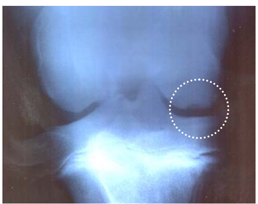
Figure 3: Radiograph Right Stifle March, 2005

Based on clinical improvement, the owners elected to pursue a second arthroscopic guided regenerative cell injection of the affected joint. Adipose tissue was recovered in the identical prior fashion as on July 2004 and 5.5 million cells were returned for surgical delivery on December 22. Arthroscopic evaluation of the medial femoro-patellar joint revealed greatly improved visual characteristics of the cartilage surface where the previous lesion was located. As gross compromise to the cartilage surface could not be visualized, the second application of adipose derived stem cells was administered via intra-articular deposition only. The patient was discharged with instructions to gradually resume the original rehabilitation program.