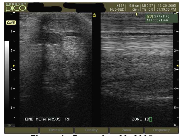
Figure 1: December 29, 2005

Based on the ultrasound appearance, a diagnosis of desmitis of the proximal suspensory ligament and of the lateral suspensory branch (ultrasound not pictured) was made and prognosis for return to prior level of competition was fair.