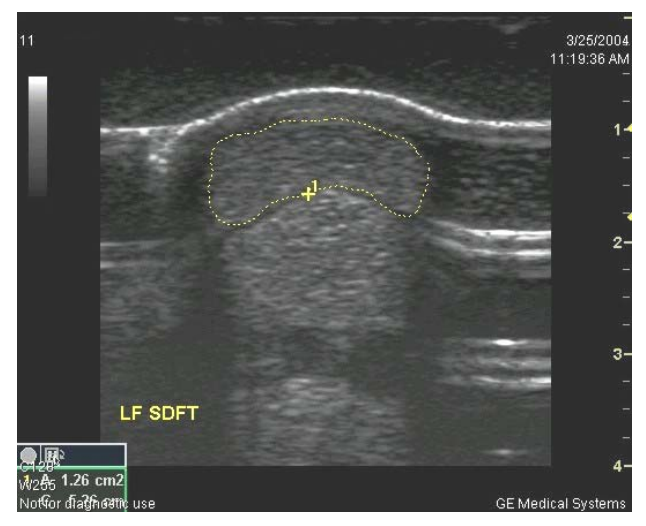
Figure 2: SDFT March 25, 2004

At one month post therapy, the ultrasonographic appearance was substantially improved with filling of the defect and normalization of the fiber pattern (Fig 2, 2a). The total cross-sectional area was reduced to 1.26 cm2 and by 90 days had returned to normal at .91 cm2. The horse continued to improve and by month 4 was returned to work under saddle. At month 6 the horse returned to full work schedule and subsequently returned to show jumping performance.